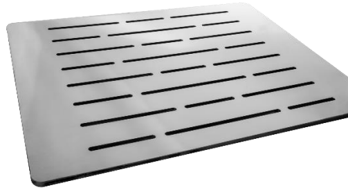
5. Perforirana rešetka