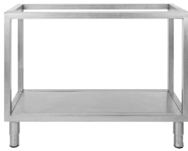
3. Postolje za robotayaki