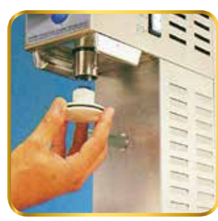
Easily removable Makrolon ® piston for a perfect cleaning